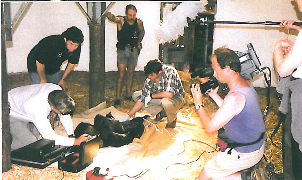
Below: Tigress Productions filmed Charlie's eye examination. (See Editor's Letter on front page).