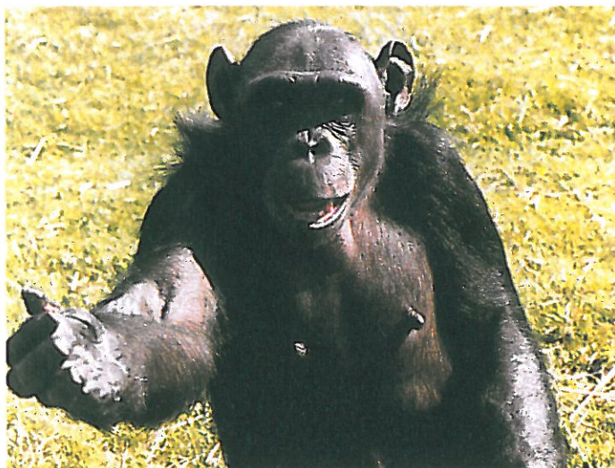
'Susy' needs a hand

There are many ways which you can help Monkey World to rescue more chimpanzees and to rehabilitate the animals we have already rescued. Any donation money goes into a 100% fund which means that every penny goes to the animals; NO administrative costs are removed. At present Monkey World has been requested to rescue 15