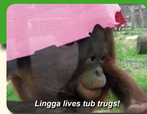
Lingga lives tub trugs!