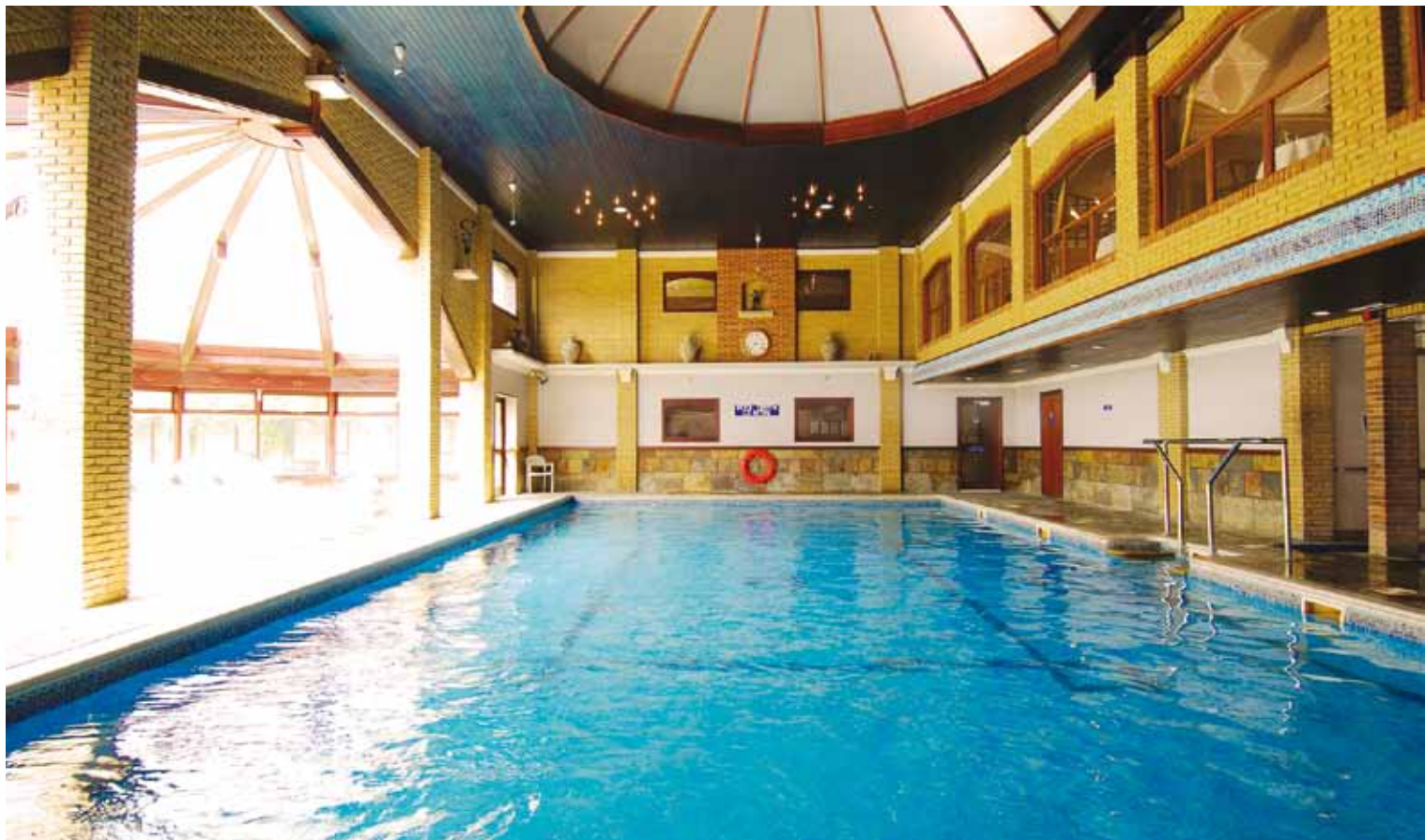
Springfield Country Hotel Leisure Club and Spa, Grange Road, Wareham, Dorset BH20 5AL

enquiries@thespringfield.co.uk Tel: 01929 552177 Fax: 01929 551862 Leisure Club Tel: 01929 554888