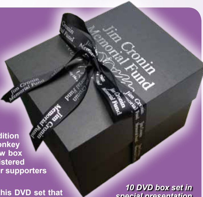
10 DVD box set in special presentation box coming soon!

To mark the 25th anniversary of Monkey World, a special edition of all 9 series of Monkey Business, plus the "10 Years of Monkey Business" DVD, have been brought together in a beautiful new box set! With proceeds going to the Jim Cronin Memorial Fund (registered charity number 1126939), this will be a lovely collector's item for supporters of the park. Enjoy the original television series time and time again, with this DVD set that has been digitally processed for widescreen TV. The box set is currently in production and will be available for sale in the Gift Shop and the new online store at www.jimcroninmemorialfund.org very soon.